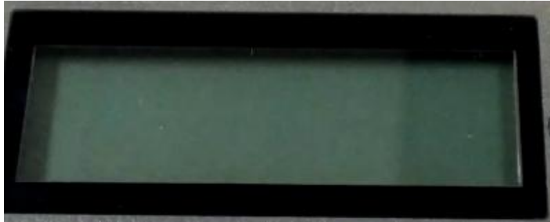
(Figure 3. Update Process Complete)

10. After the update process is complete, the LCD screen backlight will turn off and the screen text will be removed from the screen (see Figure 3).